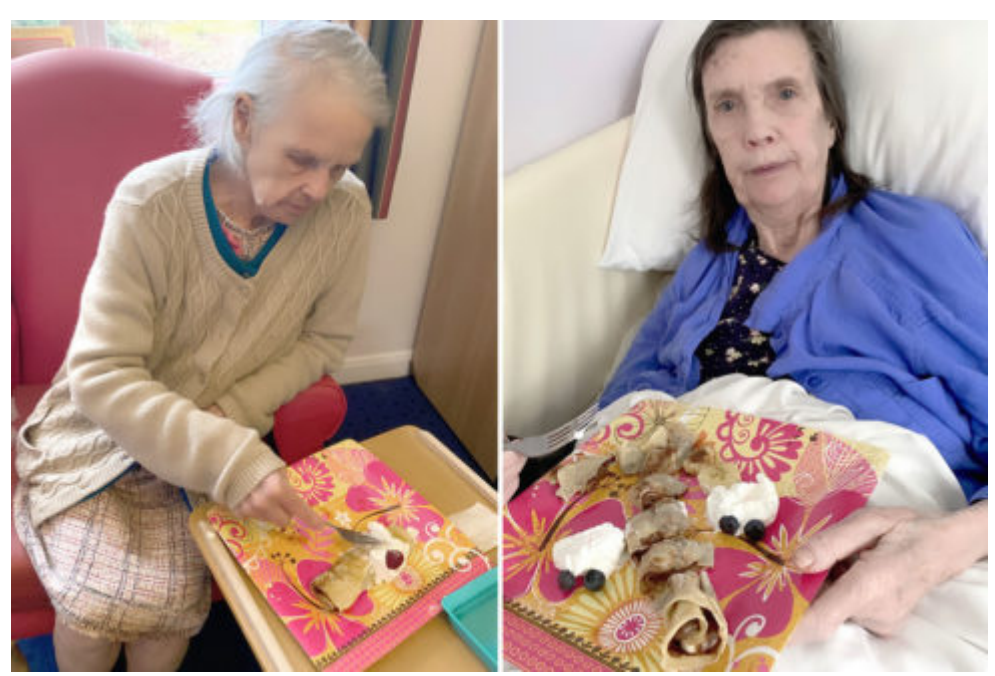
Enjoying lots of lovely toppings