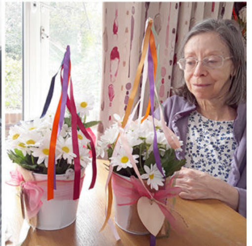
Our beautiful May Day arrangements